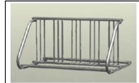
“Wheel-bender” racks (above) can damage wheels and don’t allow frames to be locked to the rack.

Costs: The cost to purchase and install bike rack varies, but is almost always cheaper and more efficient than providing car parking: